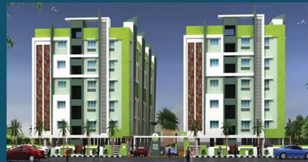
GREEN LIFE APARTMENTS, Gajuwaka